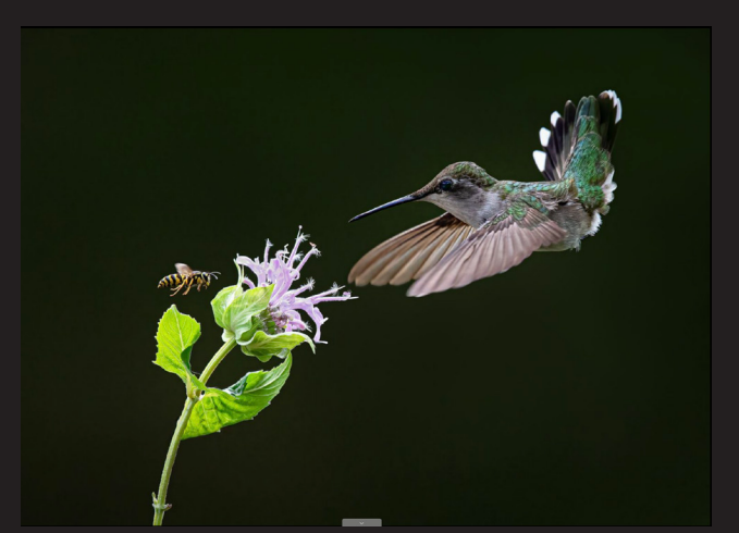
Hummingbird & Wasp, Gord Sawyer