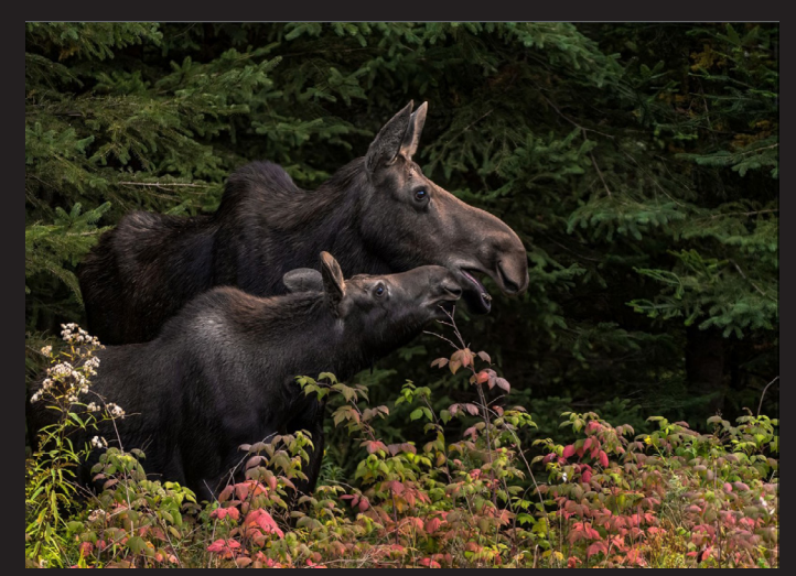
Moose Family — Mother and Calf